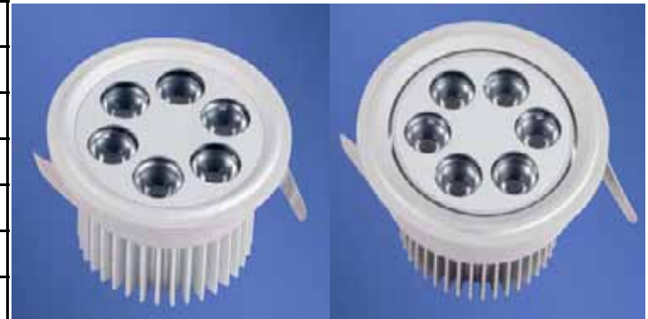
Fix type size:90 x H53mm cut-out:76mm