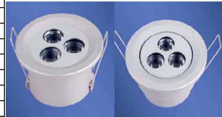
Fix type size:76 x H40mm cut-out:62mm